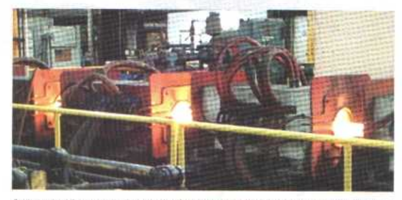
As is typical for most in-line production systems with frequent up and down times, operating costs are reduced since no holding temperatures are required during idle time.

Ajax TOCCO Magnethermic's technical leadership has helped pipe and tube producers to improve quality, increase production and lower costs to meet tough market demands. Ajax TOCCO Magnethermic is ready to put this experience to work for you. Isn't it time you called the people who know induction heating best? The people who teach the world how to use induction heating . . . Ajax Tocco Magnethermic.