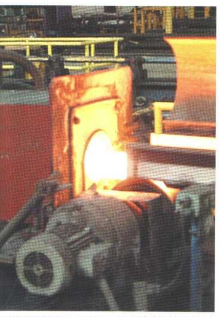
Individually powered control zones enable the Ajax TOCCO Magnethermic induction heating system to remove the end to end temperature taper in seamless tube prior to stretch reduction. Other benefits of induction heating include reduced floor space, cooler working environment, dramatic scale reduction and improved product.

Ajax TOCCO Magnethermic is at the forefront in developing induction heating technology for tubular products. With leading edge technology serving the tubular products industries since 1916, Ajax TOCCO Magnethermic has been teaching the world how to use induction heating. Starting with the simplest application to pioneering the use of induction quench and temper lines to meet API standards.