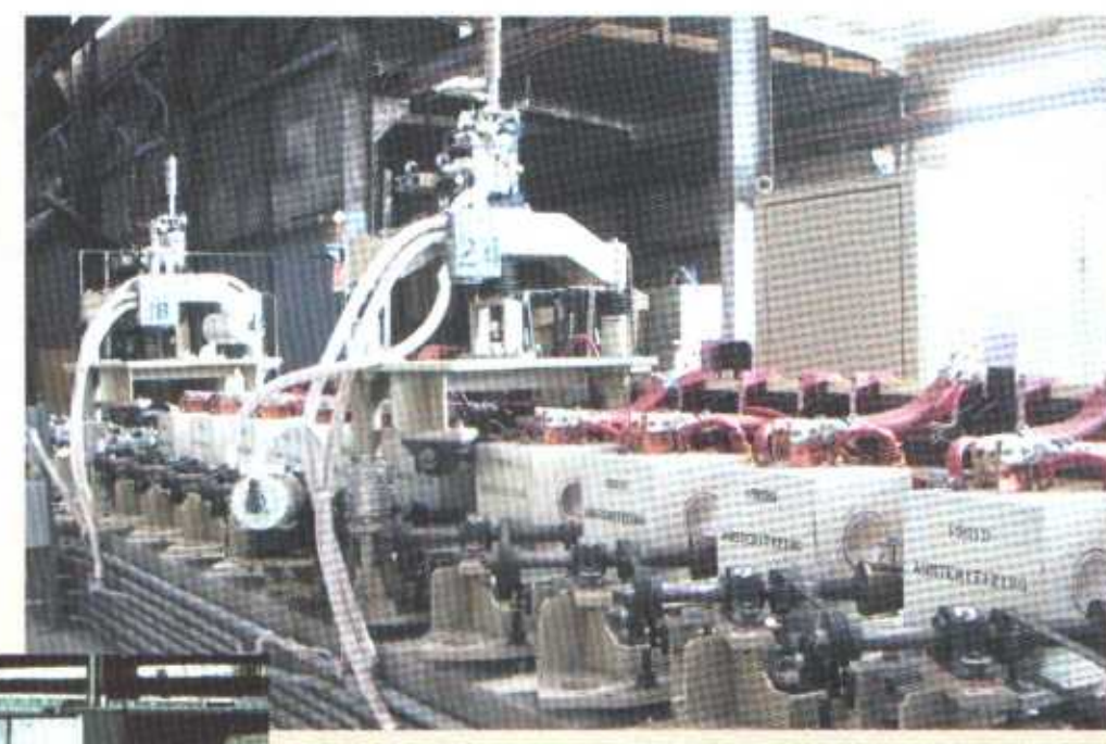
Ajax TOCCO Magnethermic pipe heating lines are known industry wide for producing superior metallurgical and physical properties in the final product. These benefits are achieved with the fast heating rates and temperature control possible only with induction heating.