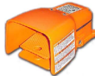
Heavy Duty Foot Switch for hands free initiation of process