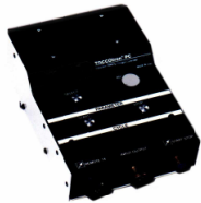
Pendant Controller for process control