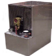
Water Recirculating Systems