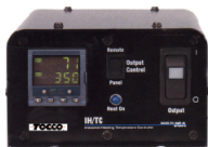
TOCCOtron Temperature Controller